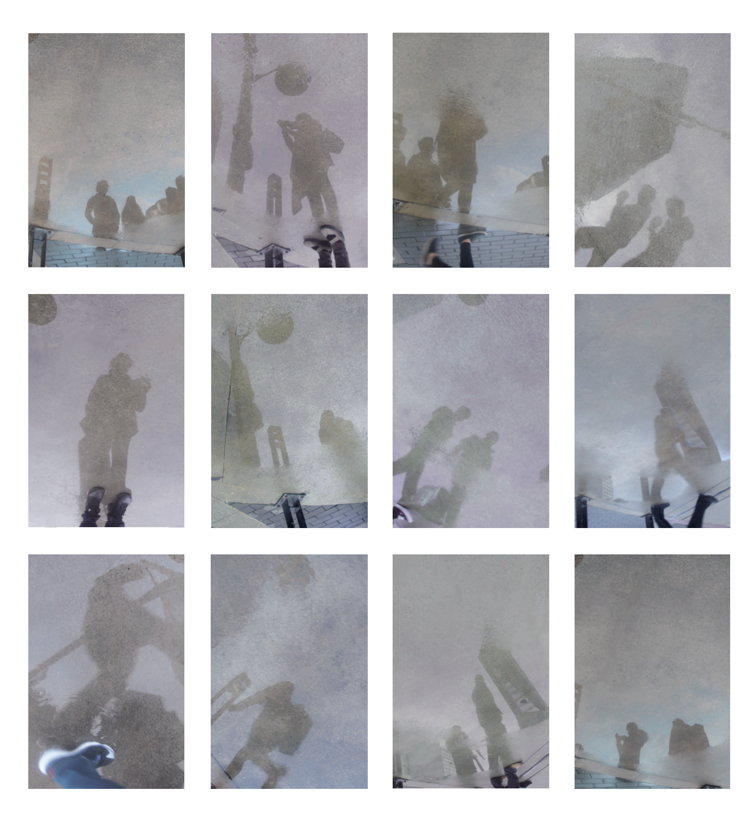
Sketchbook Communications: art books